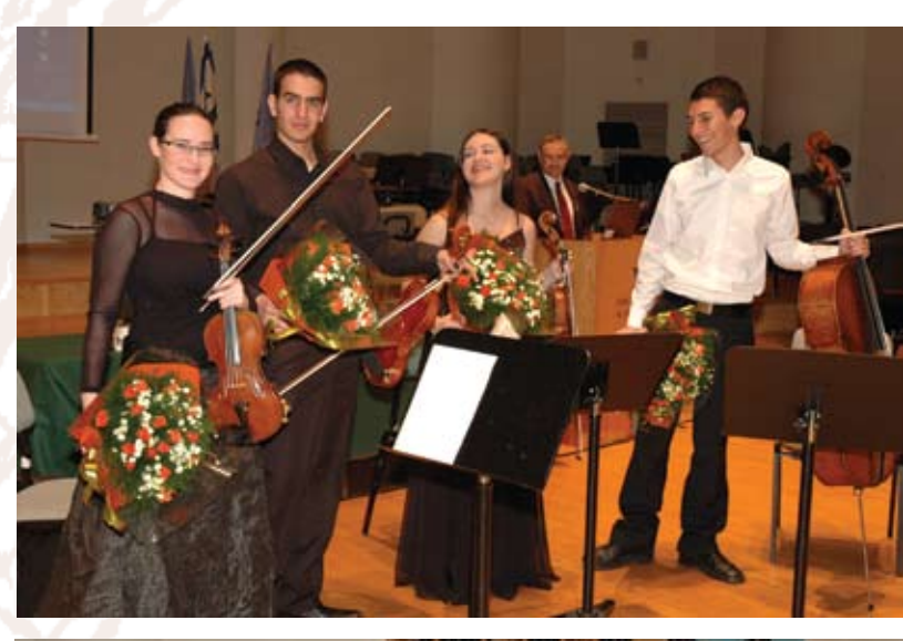
The string quartet from TAU Academy of Music