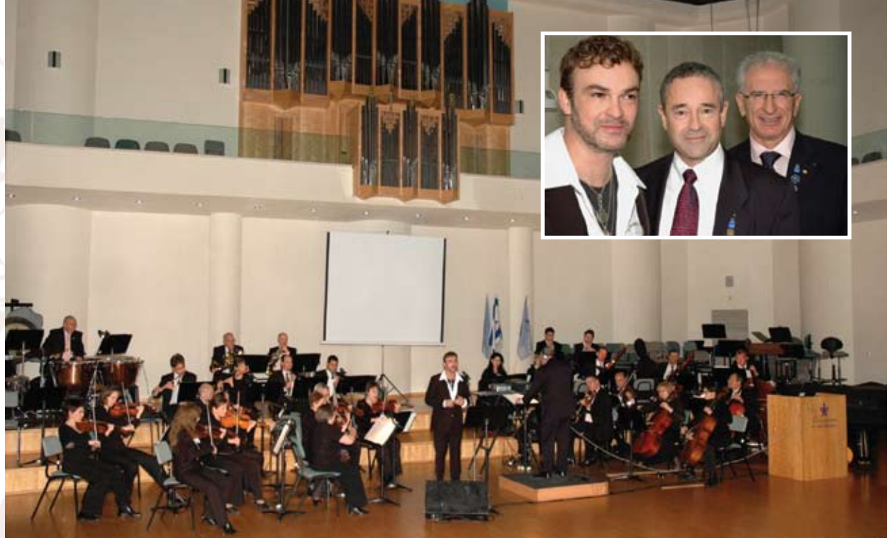
The Raanana Symphonette Orchestra