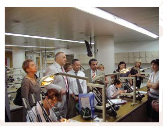
The Moscow mission at the phantom laboratory.